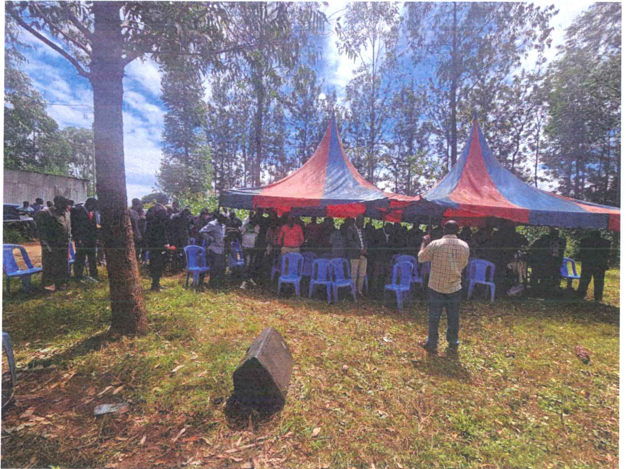
Citizen Fora Meeting in progress