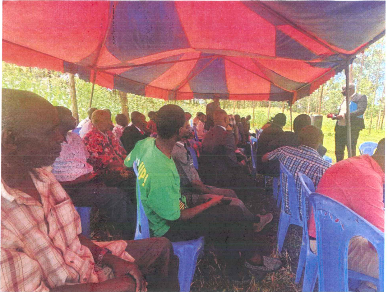
Citizen Fora Meeting in progress