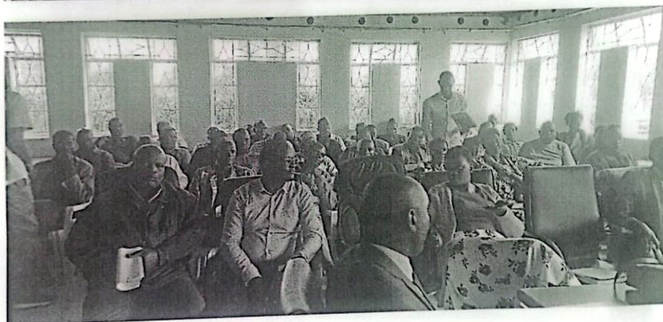
Members of the public actively participating in the forum